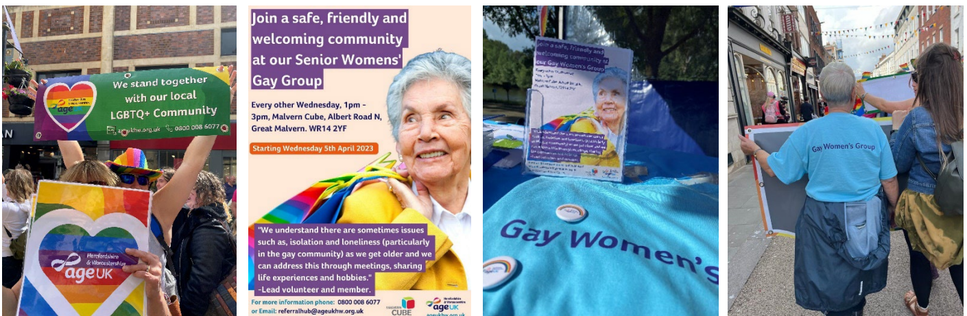
Photos Left to right: Pride procession and signs, poster, Pride table layout, walking in the Pride procession.

We have supported the group and attended both Malvern Pride and Worcester Pride and walked in the Worcester Pride Procession. We had an article in the Malvern Gazette.