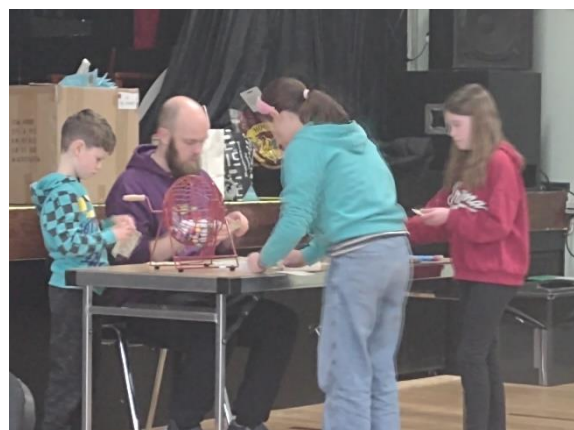
Setting up the bingo

www.everybodydance.org.uk facebook.com/rfeverybodydance twitter.com/everyBODYdancin instagram.com/rf.everybody.dance